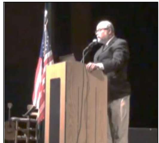
Goodhue County GOP Governor Candidate Forum: Stump Speech